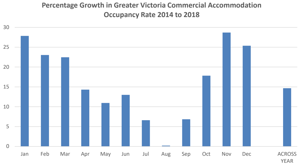
Figure 1: Percentage Growth in Greater Victoria Commercial Accommodation Occupancy Rate 2014 to 2018