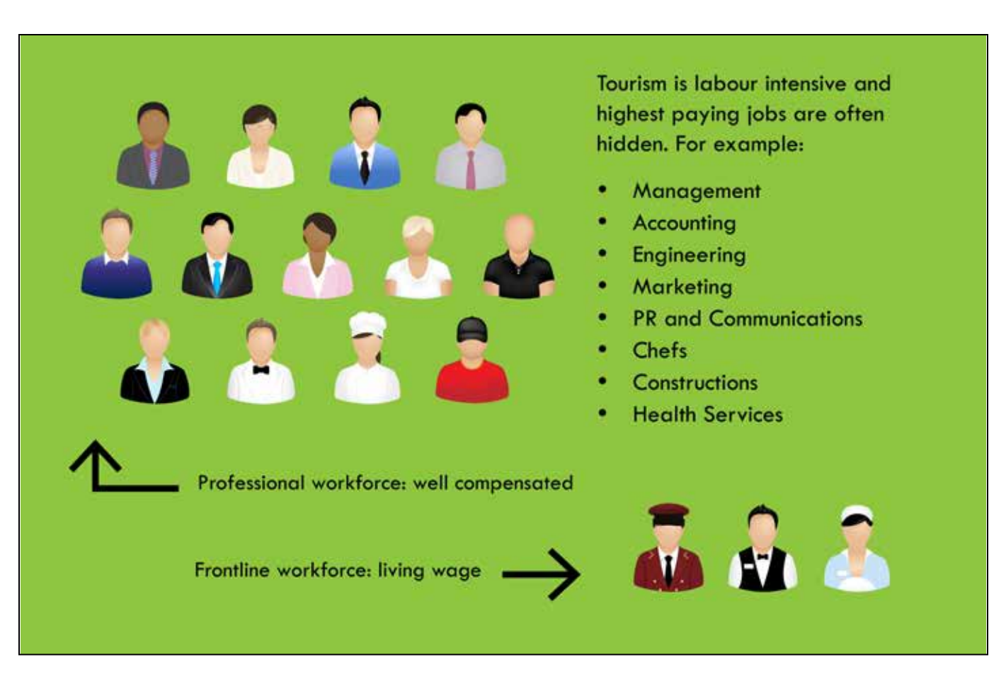
Tourism's Diverse Labour Force

Some of the objectives in this plan place specific emphasis on creating more demand through volume, which drives rate and working on seasonality. The clearest beneficiaries of these are the accommodation sector; however the benefits quickly spread throughout the economy to all our members. This is because a full and vibrant accommodation sector is the starting point of a healthy tourism ecosystem. If we have more customers in the destination spending time with overnight or stays of several days or longer all other sectors will benefit immediately from their patronage. A healthy tourism economy starts with enticing customers to make a commitment to stay and visit and then spend within the community. One cannot be achieved without the other.