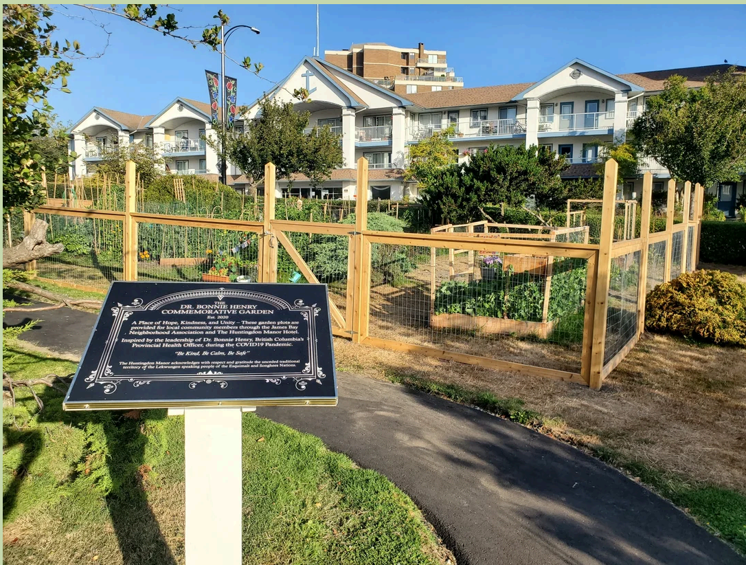
Photo: Dr. Bonnie Henry Commemorative Garden