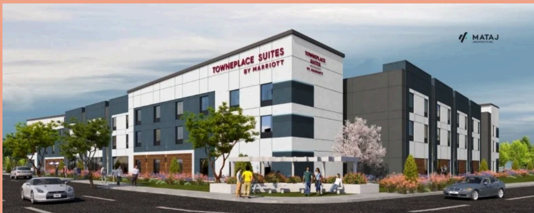
Photo: TownePlace Suites By Marriott Victoria Airport Rendering Photo Credit: Mataj Architects Inc.

On September 20th, Porter Airlines will begin their daily return flight service from Toronto to Victoria. Porter Airlines' state-of-the-art, fuel-efficient Embraer E195-E2 aircraft are environmentally friendly single-aisle aircraft. They are up to 65 percent quieter and up to 25 percent cleaner than previous-generation aircraft. The passenger-focused design features only aisle or window seating for every passenger, with no middle seats. This new route marks the first Porter Airlines connection to Victoria.