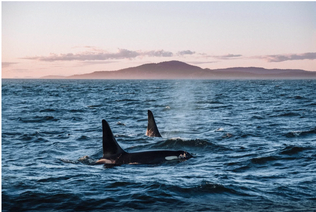
Photo: Whale Watching in Victoria, BC.

eco-friendly nature, shopping secondhand in Victoria is a way to express your unique style with clothing items from different times and places.