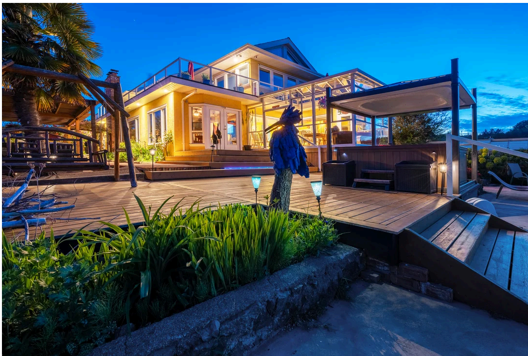
Photo: Birds of a Feather Oceanfront B&B Photo Credit: Destination Greater Victoria

For more product updates, consult our What's New Document .