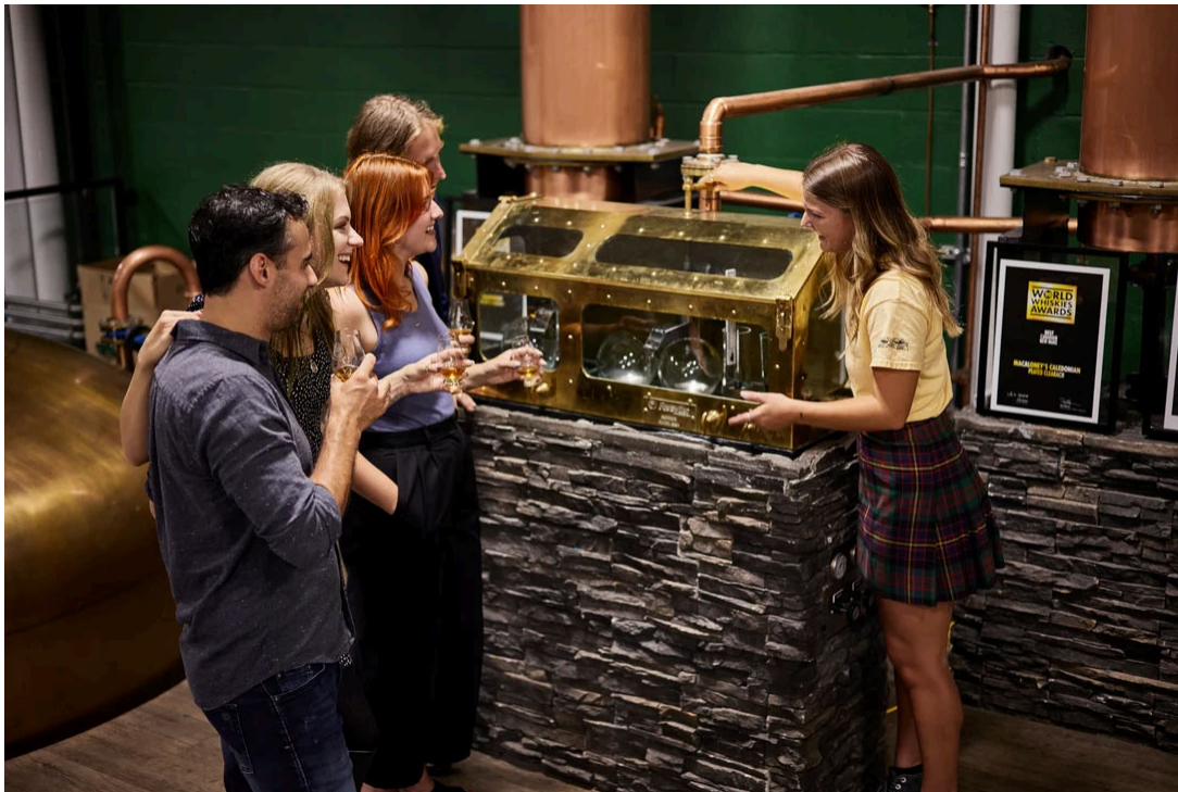
Image: Distillery at Macaloney's Island Distillery