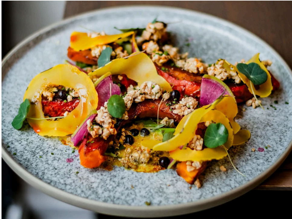
Image: Roasted Kuri Squash from 2025 Dine Around Menu

Dine Around 2025 features over 50 of Victoria's top restaurants offering set three-course menus at deliciously low prices, delighting locals and visitors alike! This 17-day culinary festival has the city's leading chefs curate some of the best farmed and foraged ingredients the region has to offer. More information can be found here .